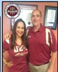
FLORIDA STATE SEMINOLES