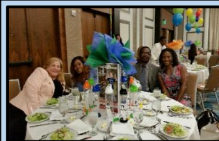
Jan Mann representatives attending the 2016 Blood Donation Awards.