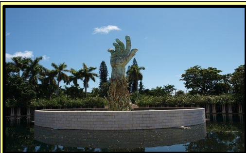
Holocaust Remembrance Honoring those who survived and remembering those who perished.